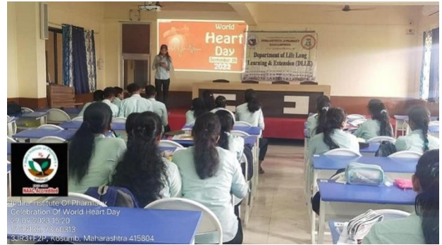
Indira Institute Of Pharmacy Celebration Of World Heart Day 29.09.2023 15:23 17.09141. 73.60318 3JR3*F2P, Kosumb, Maharashtra 415804