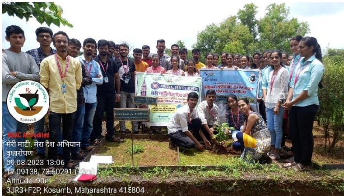
NAAC Accredited मेरी माटी, मेरा देश अभियान वृक्षारोपण 09.08.2023 13:06 17.09138, 73.60291 (+6m) Altitude: 90m 3JR3+F2P, Kosumb, Maharashtra 415804

A/P. Sadavali (Devrukh)Tal: Sangameshwar,Dist: Ratnagiri- 415804(Maharashtra) Phone:02354-241799 Fax:02354-241499 E-Mail: info@iip.ind.inWeb: www.iip.ind.in NAAC Accredited