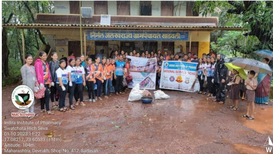
Indira Institute of Pharmacy Swachhata Hich Seva 01.10.2023 11:22 17.08217, 73.60533 (±11m) Altitude: 104m Maharashtra, Devrukh, Shop No. 412, Sadavali

A/P. Sadavali (Devrukh)Tal: Sangameshwar,Dist: Ratnagiri- 415804(Maharashtra) Phone:02354-241799 Fax:02354-241499 E-Mail: info@iip.ind.inWeb: www.iip.ind.in NAAC Accredited