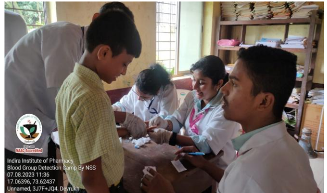
Indira Institute of Pharmacy Blood Group Detection Camp By NSS 07.08.2023 11:36 17.06396, 73.62437 Unnamed 3J7F+JQ4, Devrukh