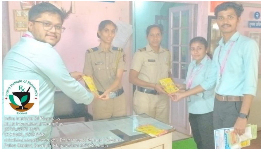
Indira Institute Of Pharmacy DILE International Youth Day 10.08.2023 11:33 1706466, 73.61368 shivdhanuniwas, Devrukh - Phanasavale Rd, near Devrukh Police Station, Devrukh, Maharashtra 415804, India

A/P. Sadavali (Devrukh)Tal: Sangameshwar,Dist: Ratnagiri- 415804(Maharashtra) Phone:02354-241799 Fax:02354-241499 E-Mail: info@iip.ind.inWeb: www.iip.ind.in NAAC Accredited