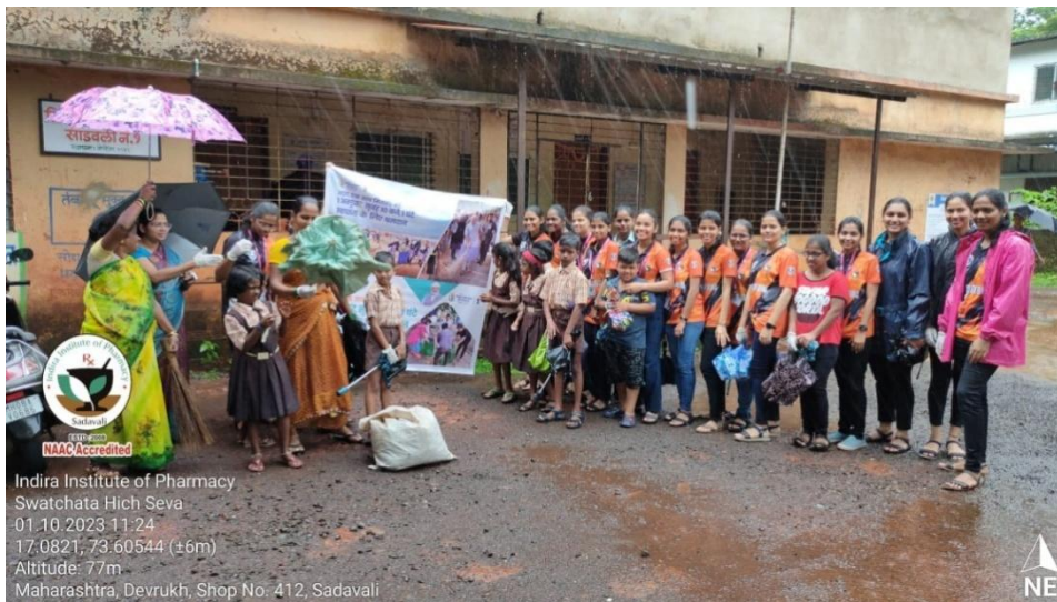
Indira Institute of Pharmacy Swachhata Hich Seva 01.10.2023 11:24 17.08217, 73.60544 (±6m) Altitude: 77m Maharashtra, Devrukh, Shop No. 412, Sadavali