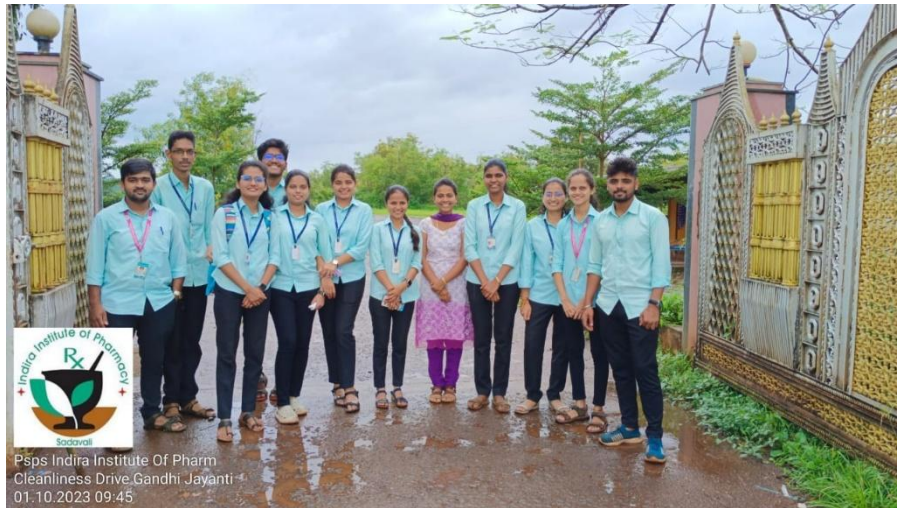
Psps Indira Institute Of Pharm Cleanliness Drive.Gandhi Jayanti 01.10.2023 09:45

A/P. Sadavali (Devrukh)Tal: Sangameshwar,Dist: Ratnagiri- 415804(Maharashtra) Phone:02354-241799 Fax:02354-241499 E-Mail: info@iip.ind.inWeb: www.iip.ind.in NAAC Accredited