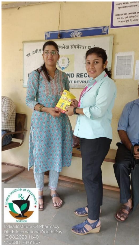
Indira Institute Of Pharmacy DILE International Youth Day 10.08.2023 11:40 170638, 73.61807