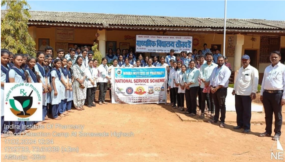
Indira Institute Of Pharmacy Blood Detection Camp At Sonawade Highsch 17.02.2024 12:24 17.12733, 73.61039 (±3m) Altitude: -35m

A/P. Sadavali (Devrukh)Tal: Sangameshwar,Dist: Ratnagiri- 415804(Maharashtra) Phone:02354-241799 Fax:02354-241499 E-Mail: info@iip.ind.inWeb: www.iip.ind.in NAAC Accredited