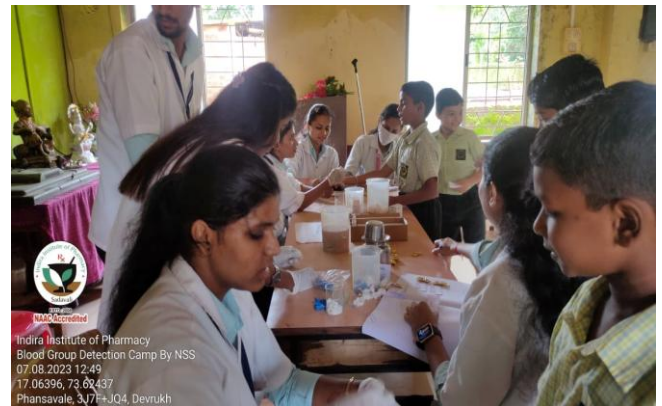
Indira Institute of Pharmacy Blood Group Detection Camp By NSS 07.08.2023 12:49 17.06396, 73.62437 Phansavale, 3J7F+JQ4, Devrukh