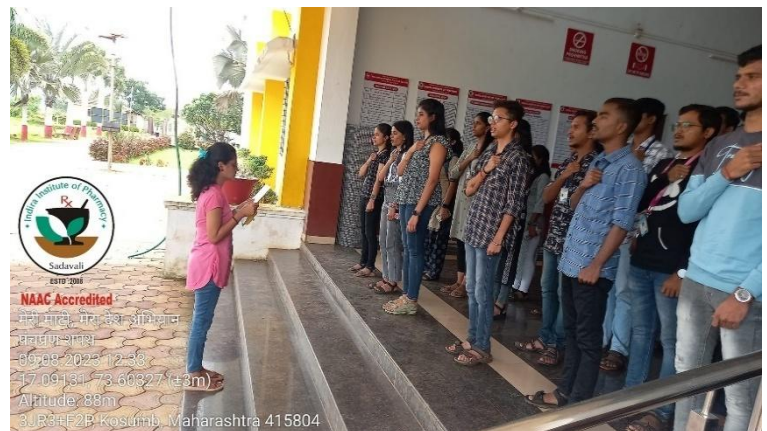
NAAC Accredited मेरी माटी, मेरा देश अभियान भक्तप्रण शपथ 09.08.2023 12:38 17.0913, 73.60327 (+3m) Altitude: 88m 3JR3+F2P, Kosumb, Maharashtra 415804