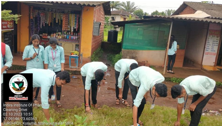
Indira Institute Of Pharmacy Cleaning Drive 02.10.2023 10:51 17.09146, 73.60363 3JR3+PQV, Kosumb, Maharashtra 415804