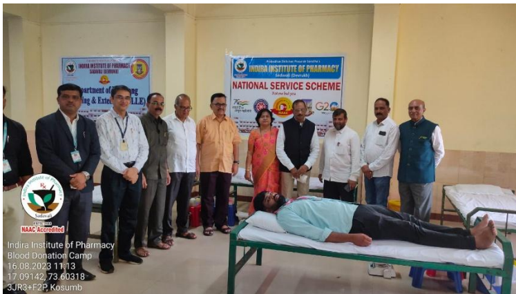
Indira Institute of Pharmacy Blood Donation Camp 16.08.2023 11:13 17.09142, 73.60318 3JR3+F2P, Kosumb

A/P. Sadavali (Devrukh)Tal: Sangameshwar,Dist: Ratnagiri- 415804(Maharashtra) Phone:02354-241799 Fax:02354-241499 E-Mail: info@iip.ind.inWeb: www.iip.ind.in NAAC Accredited