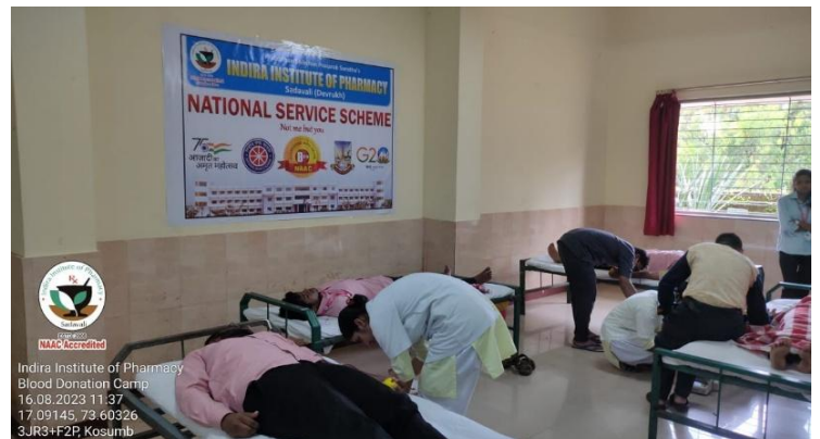
Indira Institute of Pharmacy Blood Donation Camp 16.08.2023 11:37 17.09145, 73.60326 3JR3+F2P, Kosumb