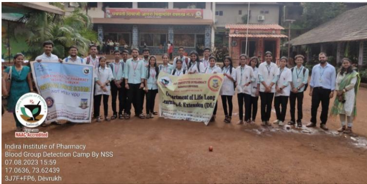
Indira Institute of Pharmacy Blood Group Detection Camp By NSS 07.08.2023 15:59 17.06396, 73.62439 3J7F+FP6, Devrukh

A/P. Sadavali (Devrukh)Tal: Sangameshwar,Dist: Ratnagiri- 415804(Maharashtra) Phone:02354-241799 Fax:02354-241499 E-Mail: info@iip.ind.inWeb: www.iip.ind.in NAAC Accredited