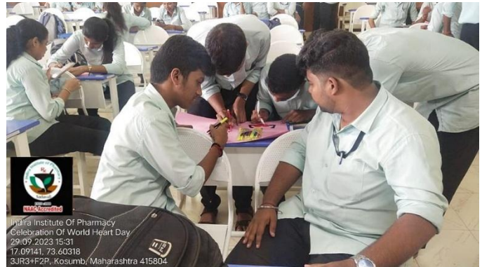
Indira Institute Of Pharmacy Celebration Of World Heart Day 29.09.2023 15:31 17.09141. 73.60318 3JR3*F2P, Kosumb, Maharashtra 415804