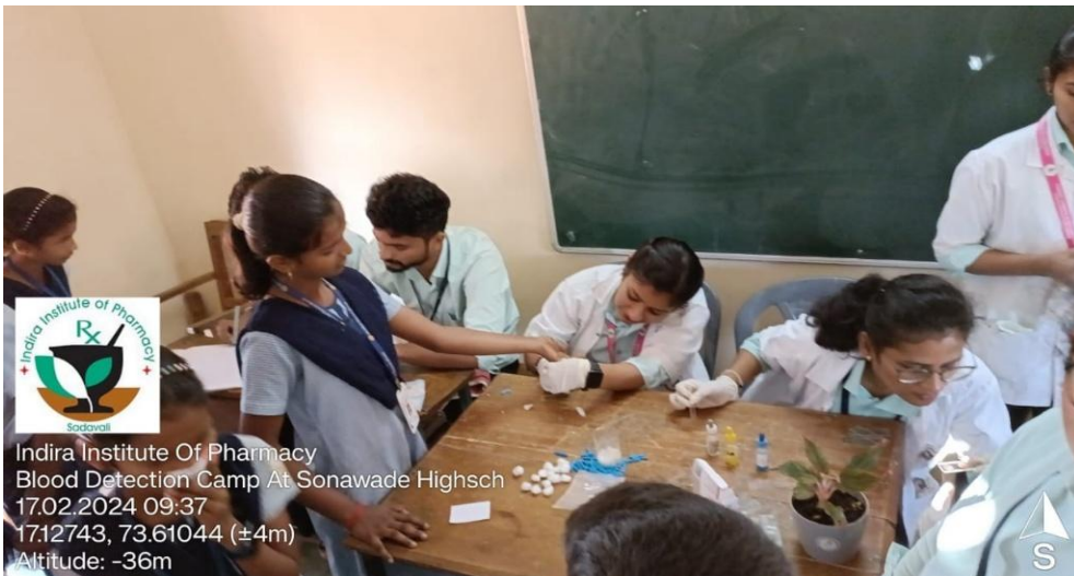
Indira Institute Of Pharmacy Blood Detection Camp At Sonawade Highsch 17.02.2024 09:37 17.12743, 73.61044 (±4m) Altitude: -36m