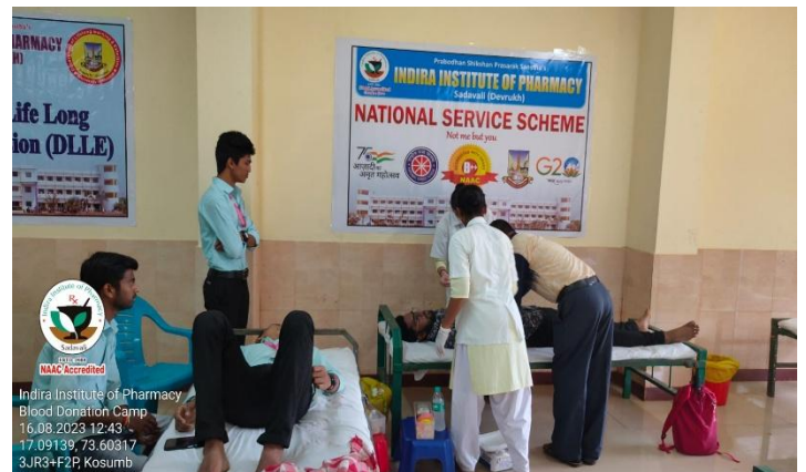
Indira Institute of Pharmacy Blood Donation Camp 16.08.2023 12:43 17.09139, 73.60317 3JR3+F2P, Kosumb