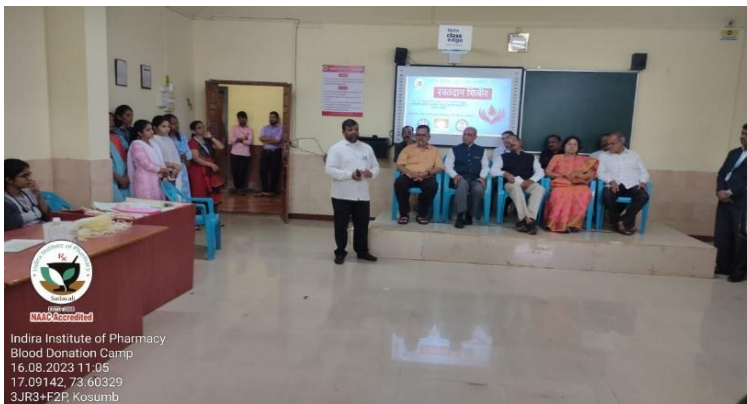
Indira Institute of Pharmacy Blood Donation Camp 16.08.2023 11:05 17.09142, 73.60329 3JR3+F2P, Kosumb