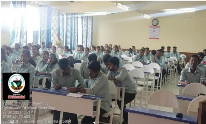
Indira Institute Of Pharmacy Celebration Of World Heart Day 29.09.2023 15:21 17.09142. 73.60319 3JR3*F2P, Kosumb, Maharashtra 415804