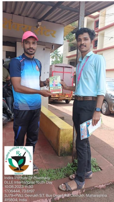
Indira Institute Of Pharmacy DILE International Youth Day 10.08.2023 11:30 1706444, 73.6197 3J79+PWJ, Devrukh S.T. Bus Depot Rd, Devrukh, Maharashtra 415804, India