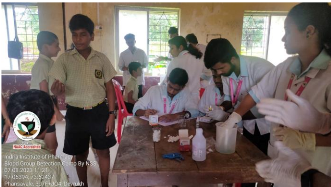
Indira Institute of Pharmacy Blood Group Detection Camp By NSS 07.08.2023 11:21 17.06394, 73.62437 Phansavale, 3J7F+JQ4, Devrukh