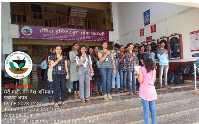
NAAC Accredited मेरी माटी, मेरा देश अभियान पंचप्रण शपथ 09.08.2023 12:33 17.09126, 73.60323 (+3m) Altitude: 86m 3JR3+F2P, Kosumb, Maharashtra 415804