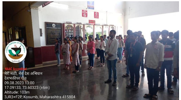
NAAC Accredited मेरी माटी, मेरा देश अभियान देशभक्तीपर गीत 09.08.2023 13:00 17.09133, 73.60323 (+6m) Altitude: 103m 3JR3+F2P, Kosumb, Maharashtra 415804